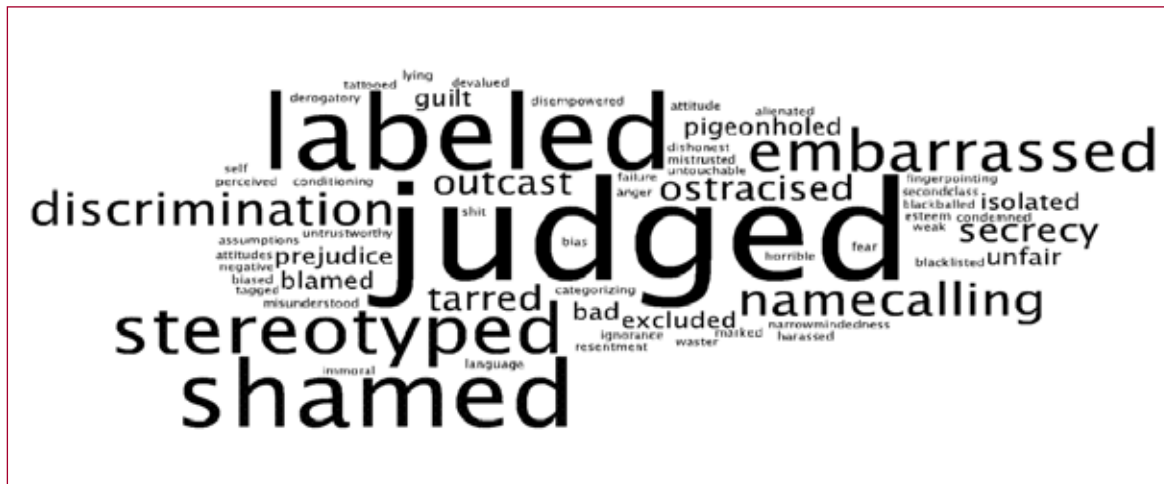
Figure 1: Graphical representation of the words used by focus group participants when asked what stigma meant to them

The negative attitudes that drug users experience and the impacts they have on them and their families are demonstrated by the way in which the people in our research focus groups responded when asked what stigma meant to them. 2